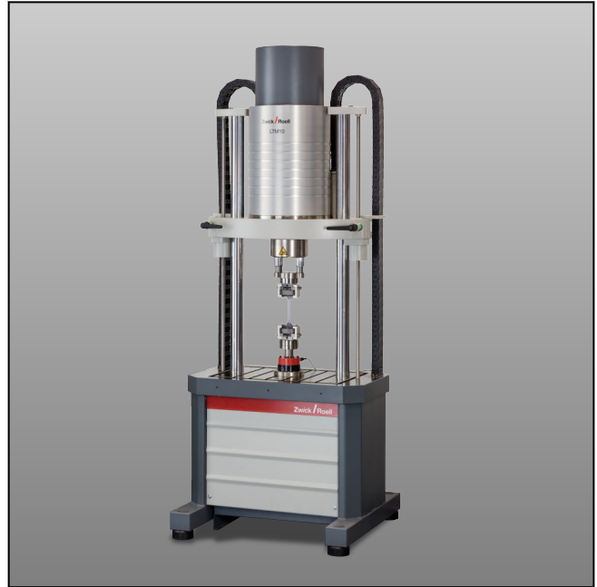
LTM 10 testing machine