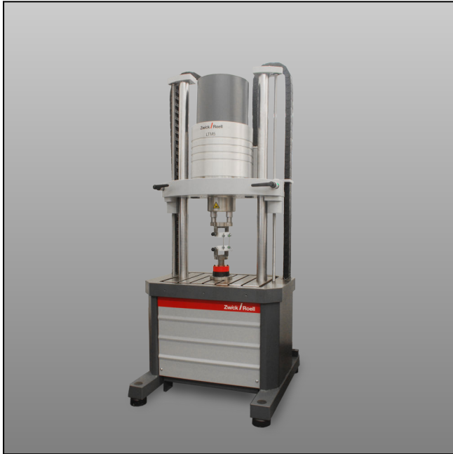
LTM 5 testing machine