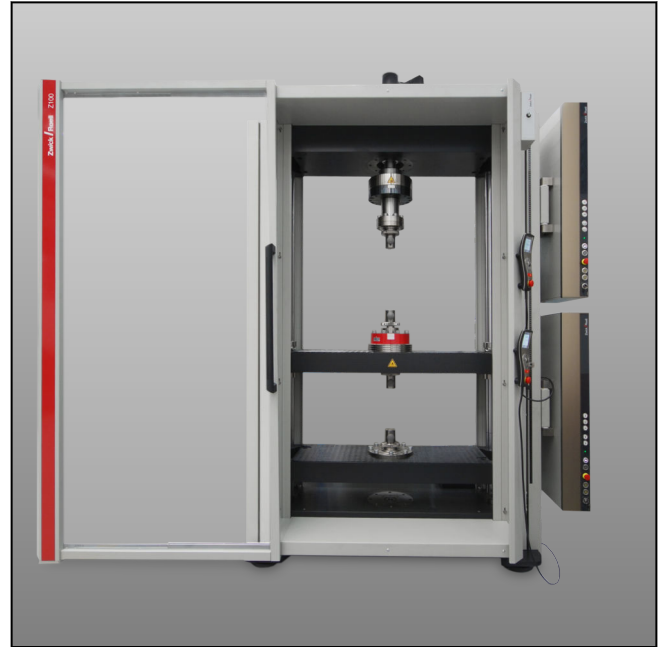
Floor-standing testing machine with torsion drive