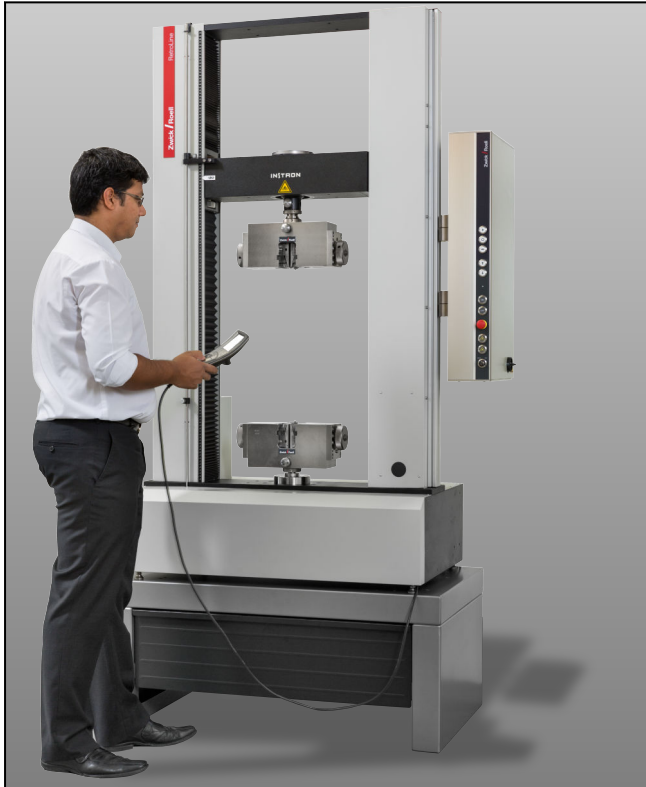
Modernized Instron® 4204 (50kN) with modern ZwickRoell accessories