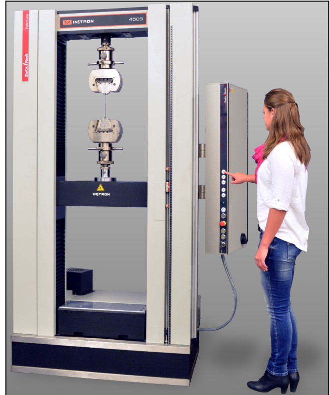
Instron® 4505 (100 kN) with new testControl II electronics