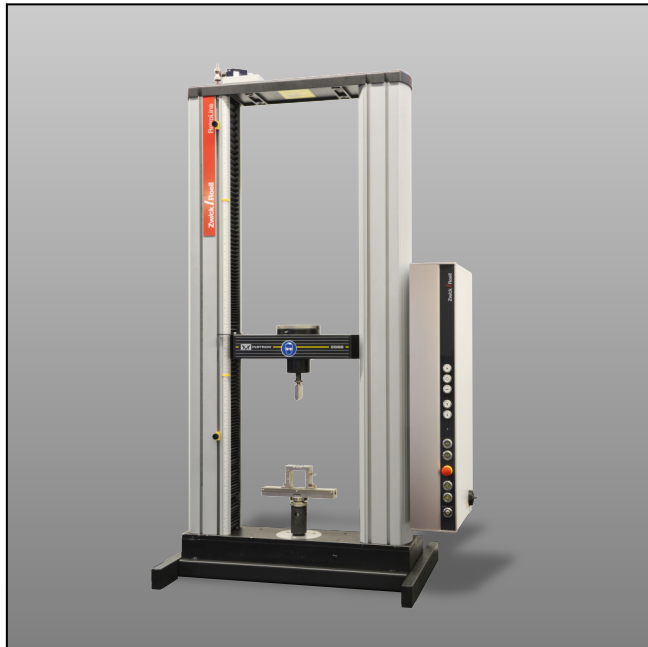
Instron® Type 5566 table-top testing machine (10 kN) with testControl II